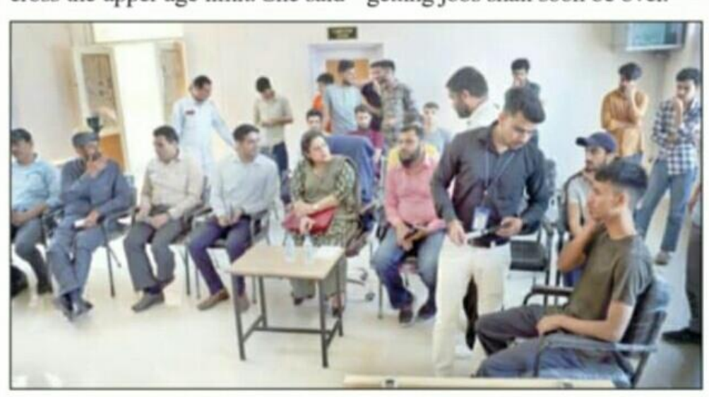
Inmates of Govt Boys Pahari Hostel Jammu attending eye test camp on Friday.